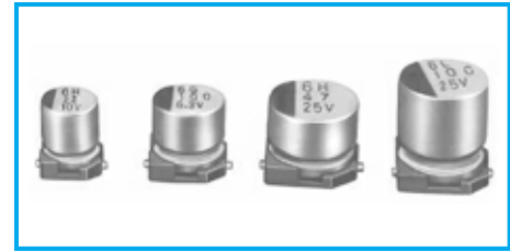
Marking color : Black print